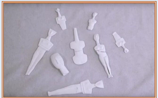
Figures 1-4: Part of the content of the museum kit of the Museum of Cycladic Art, Greece