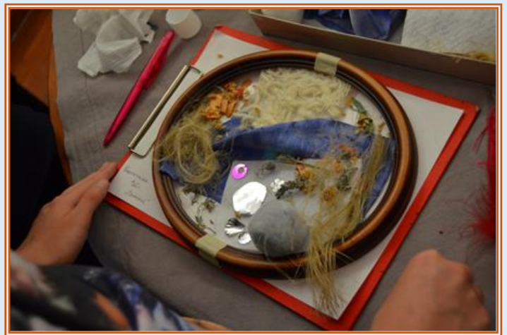
Figures 9-12: Snapshots of the differentiated programmes of the Rakursi Art Gallery, Bulgaria