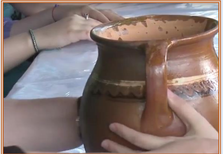
Figures 5-8: Part of the differentiated material of the Transylvanian Museum of Ethnography, Romania